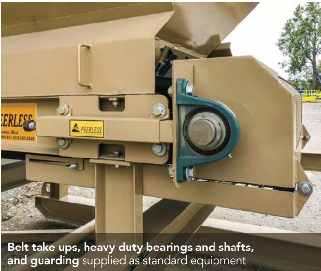
Belt take ups, heavy duty bearings and shafts, and guarding supplied as standard equipment