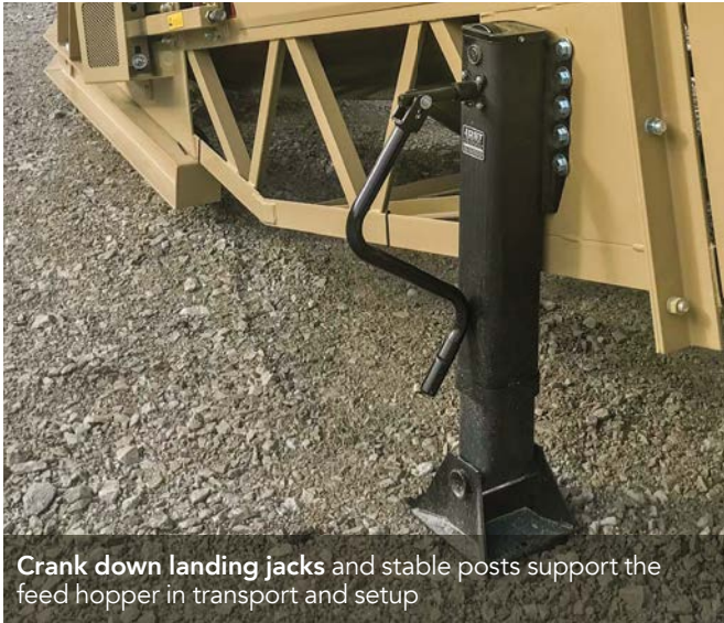
Crank down landing jacks and stable posts support the feed hopper in transport and setup