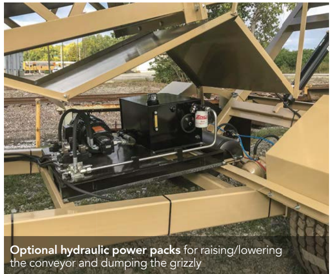
Optional hydraulic power packs for raising/lowering the conveyor and dumping the grizzly