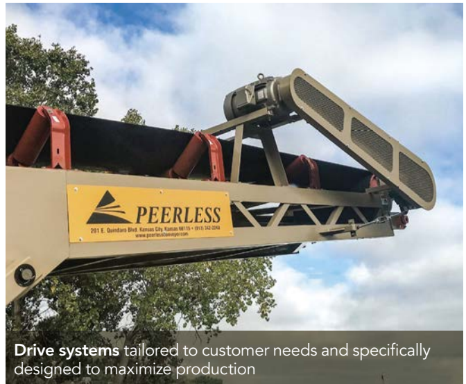
Drive systems tailored to customer needs and specifically designed to maximize production