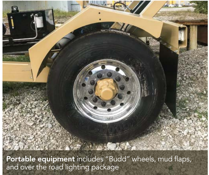
Portable equipment includes "Budd" wheels, mud flaps, and over the road lighting package