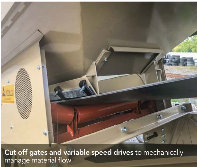
Cut off gates and variable speed drives to mechanically manage material flow